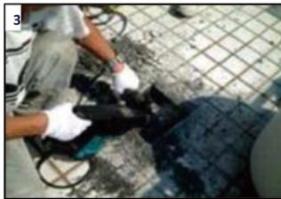
3) Cut ground larger and deeper than 1cm solar tile.