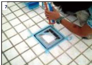
7) Fix solar tile by silicone or urethan ( no acid ingredient)