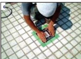
6) After put solar tiles in ground, press solar tile