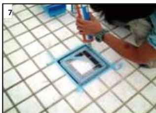
7) Fix solar tile by silicone or urethan ( no acid ingredient)