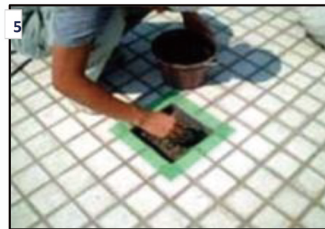
5) Spread silicone or urethan in bottom side